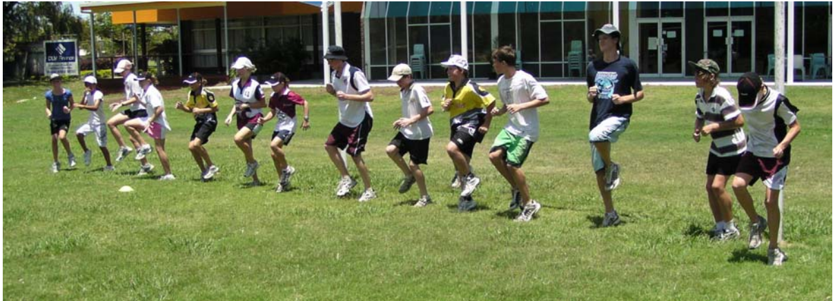
Running on the spot